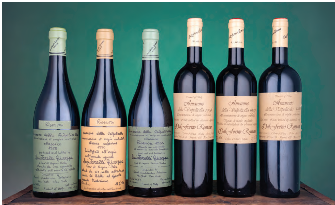
Lots 1867, 1869, 1874, 1882