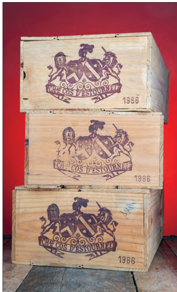
Lots 3111, 3112, 3113

3113 12 bottles (owc) per lot $1500-2200